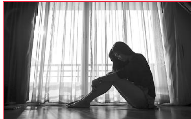
Youth, Adult, Fire & EMS Mental Health First Aid