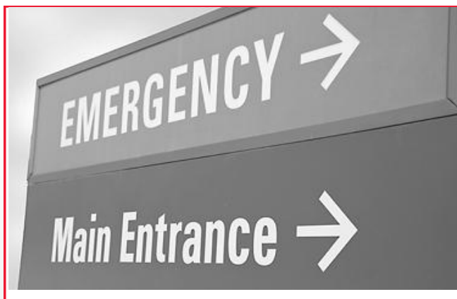
Care Transitions/ Emergency Dept. Navigation Services