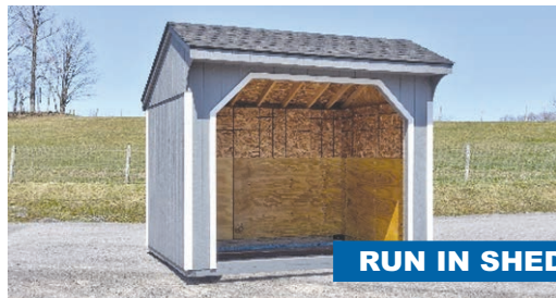
RUN IN SHEDS

Antiques & Collectibles.....7 Auctions.....7 Automotive.....11 Churches.....2 Computer Corner.....8 Employment.....7 Services Offered.....7 Farm & Country.....9 Firewood.....7 Flea Markets & Commercial Sales.....9 For The Community.....9 Garage Sales.....9 Good Times.....11 Health & Fitness.....9 Home Improvement.....8 Lawn & Garden.....7 Pets & Animals.....8 Professional Connection.....4-5 Reader Ad Form.....12 Real Estate.....9 Recreation.....9 Hunters' Headquarters.....9